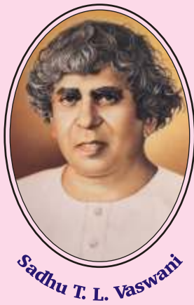
Sadhu T. L. Vaswani

The Animals Rights Day - Meatless Day Campaign is part of the SAK (Stop All Killing!) Association started under the flagship of the Sadhu Vaswani Mission and it is aimed at creating awareness in the minds of the people regarding the cruelties perpetuated on animals day after day.