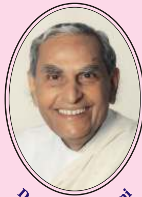
Dada J. P. Vaswani

Nov. 25 th is the birthday of Rev. Sadhu Vaswani whose compassion flowed out in an endless stream to all animals and birds. He taught us again and again that birds and animals are man's younger brothers and sisters. He said, "For me not to love birds and animals would be not to love the Lord". Hence his birthday every year is observed as An International Meatless Day and Animal Rights Day.